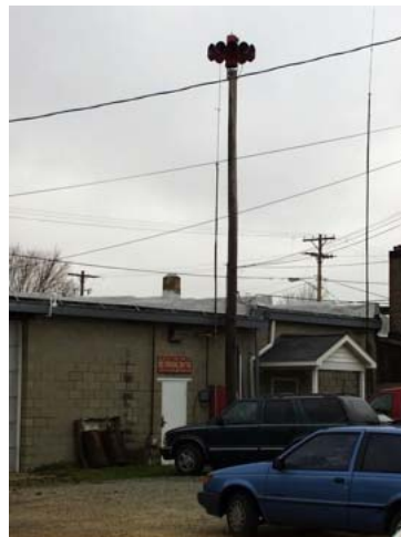
Spiceland, City of, Volunteer Fire Dept (Update Photo)