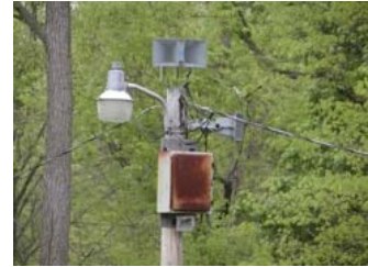
Knightstown Siren #3, Town of Located - West of park on CR 775 West