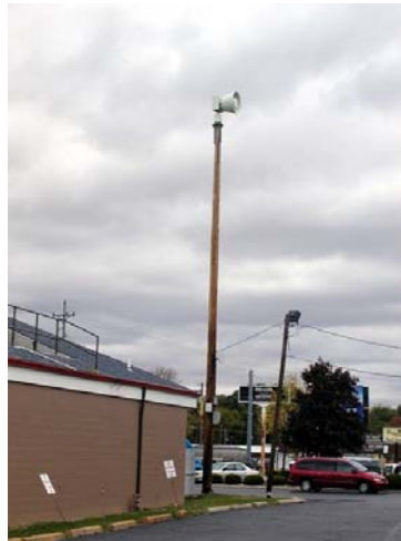
New Castle Siren #5, City of, N. Main